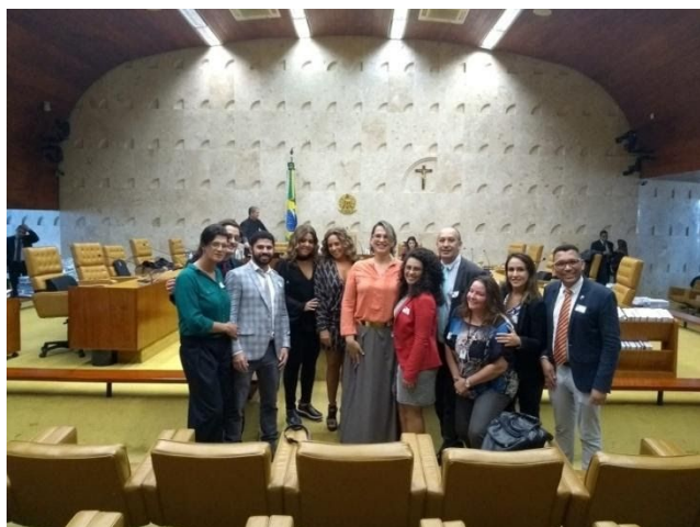
Supreme Court, 23/05