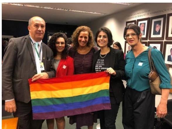
Supreme Court, 23/05 Two lady MPs supporters of the LGBTI+ cause