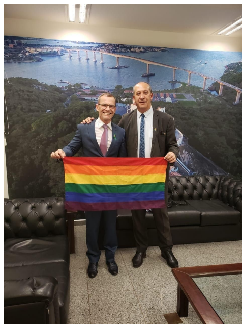
(with Brazil's first openly gay Senator, Fabiano Contarato)

On December 9 th , in commemoration of Human Rights Day (10/12), Aliança spoke at a public hearing on “Violence in Brazil”, with emphasis on more vulnerable segments, held by the Senate’s Human Rights and Participative Legislation Committee.