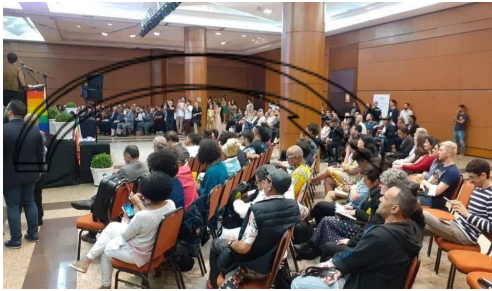
Photos of the Congress

The Business Seminar was also well represented by corporations that are developing diversity and inclusion policies for employees and, in some cases, in relation to suppliers and customers as well. This part of the Congress was aligned with the United Nations Standards of Conduct for Business: Tackling Discrimination against LGBTI and the aim of achieving Global LGBTI Equality.