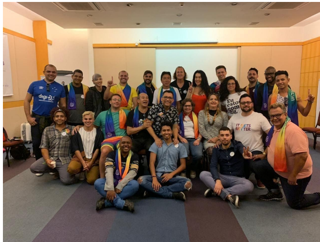
(participants at the Seminar)

On June 22 nd , during the São Paulo LGBTI+ Pride celebrations, Aliança held a Seminar with leaders of the LGBTI+ movement from all over Brazil to discuss strategic alignment and to celebrate and remember the 50 th anniversary of the Stonewall Rebellion in 1969 which gave rise to the current LGBTI+ rights movement.