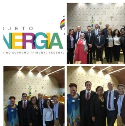
Supreme Court, 20/02