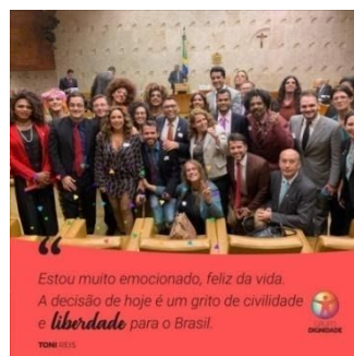
Supreme Court, 29/05

On June 13 th 2019, the Supreme Court concluded its judgement of the two cases and ruled that there had been omission on the part of the National Congress for failing to legislate on the matter and also ruled that cases of LGBTIphobic discrimination and violence must be judged by the country's courts as cases of racism, punishable as such by law if found guilty.