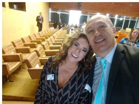
Supreme Court, 23/05 Singer Daniele Mercury (celebrity adding weight to advocacy work)

Av. Mal. Floriano Peixoto, 366, Cj. 43, Centro, 80010-130 - Curitiba-PR, Brasil