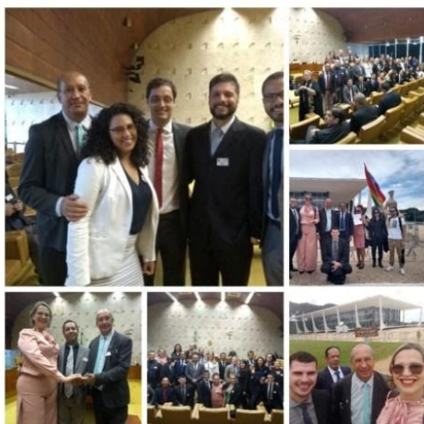
Supreme Court, 14/02